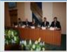
11 Meeting of the EUROSAT Task Force will be held in June

Task Force reported to the EUROSAT Governing Board