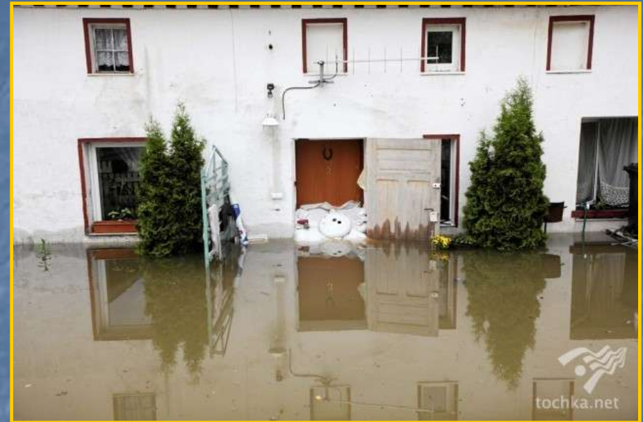
Hungary, June 2010

involving widespread human, material, economic or environmental losses and impacts, which exceeds the ability of the affected community or society to cope using its own resources.