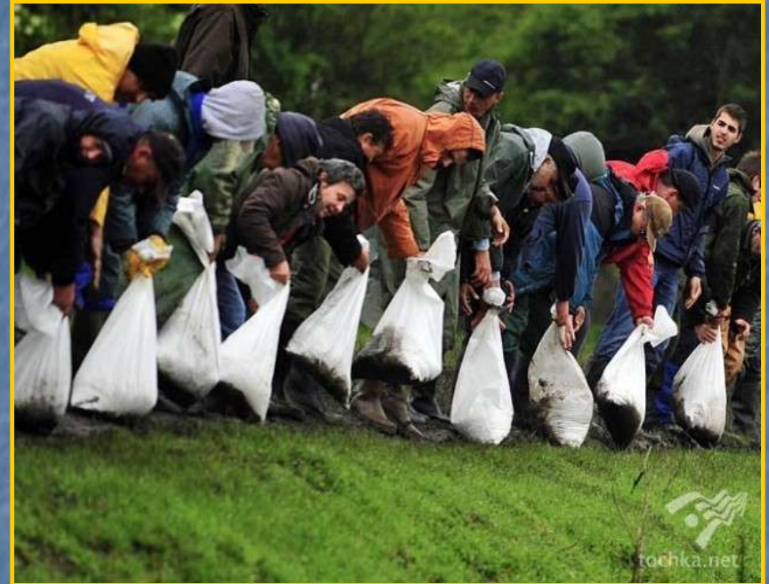
Hungary, June 2010

Disruption of normal conditions of the vital activities of people at some entity or territory as a result of an accident, disaster or catastrophe of natural or social - biological character that caused or may cause human and material losses.