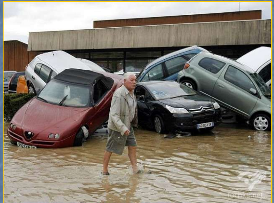
France, June 2010