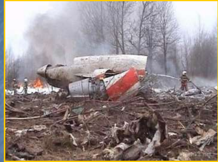
Российская Федерация, 2010

A catastrophic event could result in sustained national impacts over a prolonged period of time; almost immediately exceeds resources normally available to State, local and private-sector authorities in the impacted area; and significantly interrupts governmental operations and emergency services to such an extent that national security could be threatened. All catastrophic events are Incidents of National Significance. (AADA)