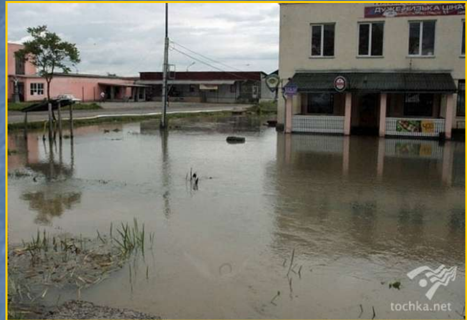
Ukraine, June 2010